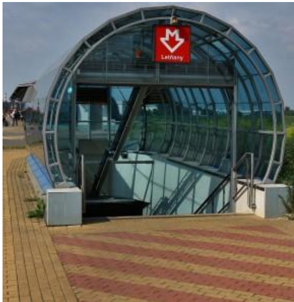
metro entrance (line C, Letňany station)

For you to be able to easily find stops and stations of the public transport means we bring some pictures: