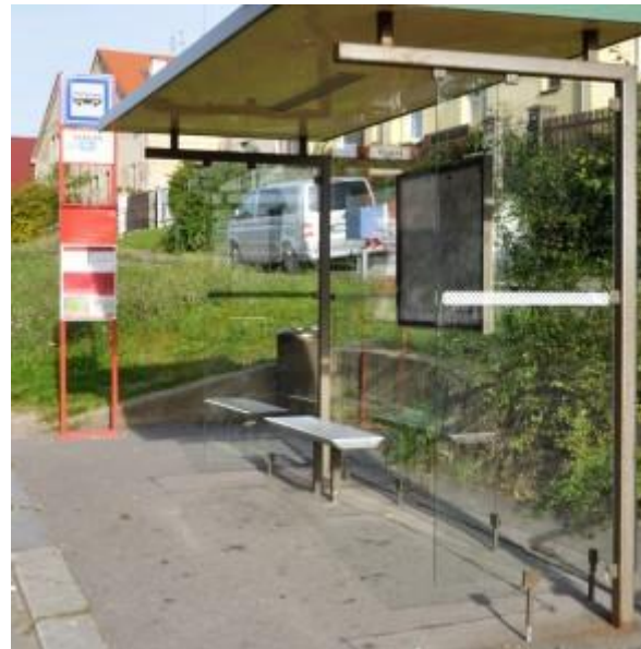
surface transport stop (buses, trams)

Some stops are designated as request stops ( NA ZNAMENÍ ). At these stops, when you want to get on the arriving vehicle, you should stand at a place where the driver can see you – no other steps are necessary. If you want to get off at a request stop, you need to press the door button soon enough before arriving to the stop. Note that some older trams don't have door buttons, in this case the tram will always stop.